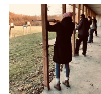
This year with target shooting

Starting at 11:00am in the GERMANIA PARK